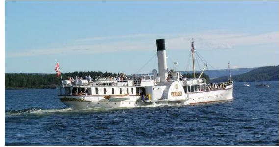
Skibladner is a steam ship.

Innlandet is the only county that does not have a coastline. The county borders Sweden. The biggest lake in Norway is Mjøsa. Mjøsa is located in Innlandet. Mjøsa is known for Skibladner, which is the oldest ship still in use in Norway. Skibladner sails between Eidsvoll, Hamar, Lillehammer and Gjøvik.