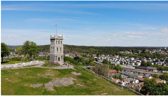
Slottsfjellet in Tønsberg

Tønsberg is located in Vestfold og Telemark, and it is the oldest city in Norway. It was founded in approx. 870. Slottsfjellet is located in Tønsberg and is the biggest ruined town in Northern Europe.