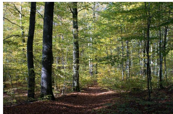
Bøkeskogen in Larvik

Farrisvannet lake is located in Vestfold og Telemark county. This lake has given its name to the mineral water brand Farris. But Farris does not come from the Farrisvannet lake, it is drawn from sources under the adjacent Bøkeskogen forest floor.