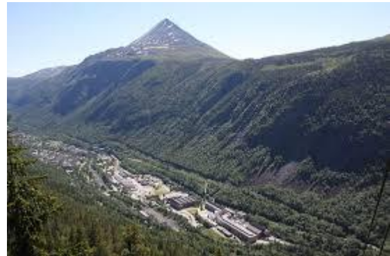
Gaustadtoppen. The town of Rjukan can be seen down in the valley.

Gaustadtoppen is located in Rjukan and is 1,883 metres above sea level.