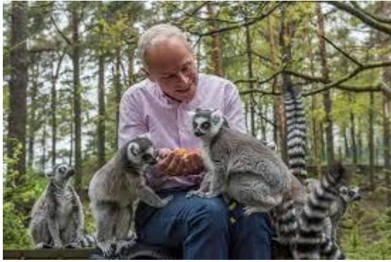
Lemurs at Kristiansand Zoo.