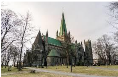
Nidaros Cathedral

The biggest city in Trøndelag is Trondheim. Trondheim is the third biggest city in Norway. Nidaros Cathedral is the main church in Trøndelag. It was built on the site of the grave of Saint Olav. Saint Olav was a Viking king. He lived in around year 1000. He visited other countries in Europe and learned about Christianity. He decided that Christendom should be the only religion permitted in Norway. Nidaros Cathedral is located in Trondheim.