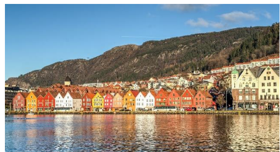
Bryggen in Bergen

The biggest city in Western Norway is Bergen. Bergen is the second biggest city in Norway, and it is often called the capital of Western Norway. Bryggen is a well-known attraction in Bergen.