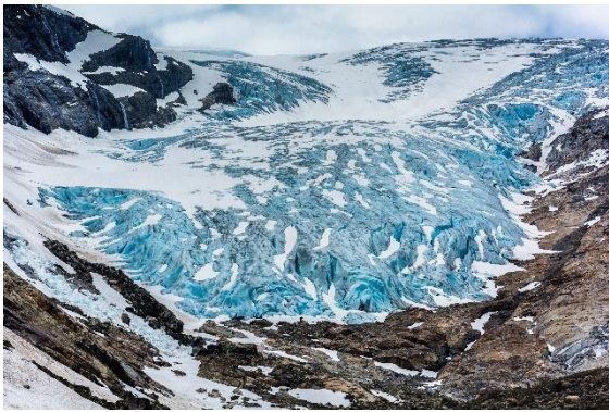
Jostedalsbreen glacier

The Jostedalsbreen glacier is the biggest glacier in Norway. Jostedalsbreen glacier is located in Vestland county.