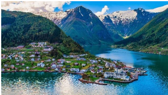
Balestrand is located on the Sognefjord.

The counties in Western Norway are called Møre og Romsdal, Vestland and Rogaland. Western Norway is world famous for its long fjords and high mountains. The longest fjord in Norway is the Sognefjord, which is located in Western Norway. It is 204 kilometres long.