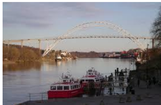
The mouth of Glomma is in Fredrikstad.

Glomma is 619 kilometres long and flows from Trøndelag in the north to Fredrikstad in the south of Eastern Norway.