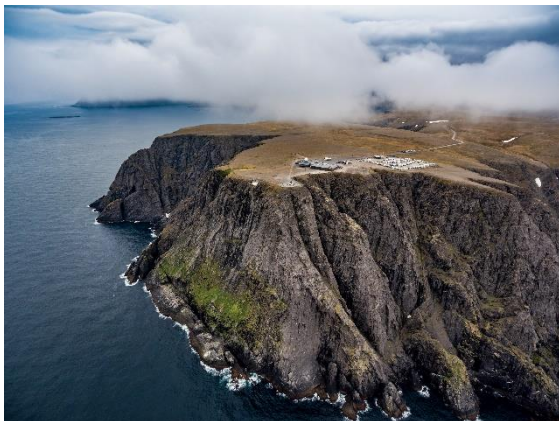
The North Cape

and Sweden. Tromsø is the largest city in Troms og Finnmark. Norway's northernmost point, Knivskjellodden, is located in Troms og Finnmark. The North Cape (Nordkapp) is better known and is located almost as far north as Knivskjellodden. The North Cape is a famous tourist destination in Norway.