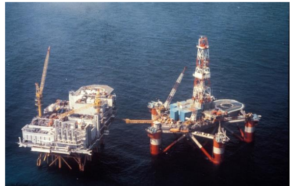
Oil platform

The biggest city in Rogaland is Stavanger. Oil was discovered in the North Sea at the end of the 1960s. It was decided that the headquarters of the oil industry should be based in Stavanger. There were four members of staff in the beginning. One of them, Farouk Al-Kasim, was from Iraq.