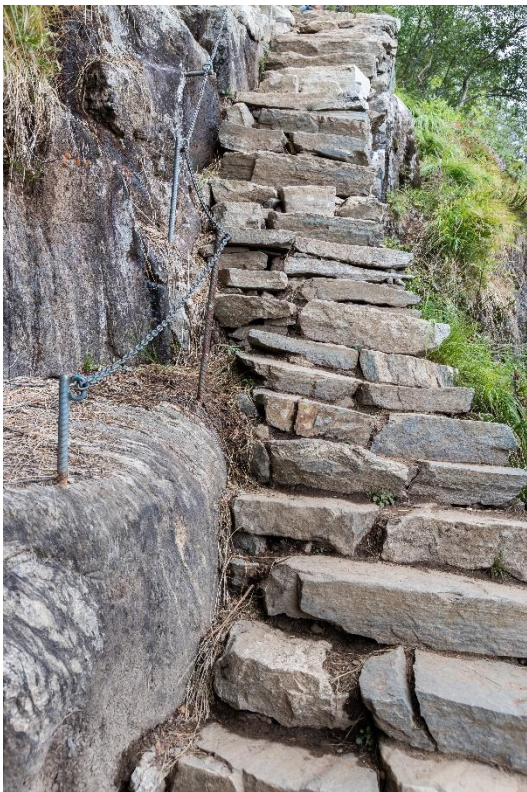
Rock steps

Midsundtrappen comprises 22,000 rock steps. It was built by sherpas from Nepal.