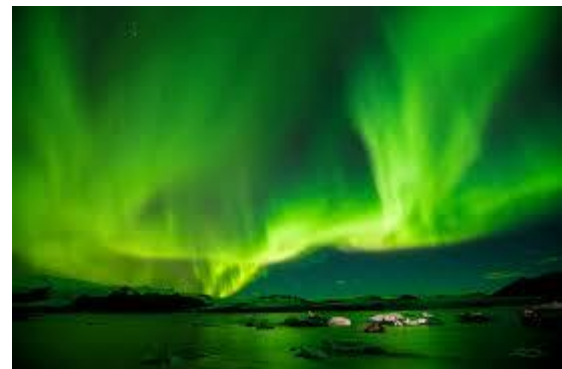
Northern lights.

If you visit Northern Norway in December or January, you can experience the polar night. The polar night is when the sun is under the horizon the whole day. In Northern Norway, you can see the northern lights in winter.