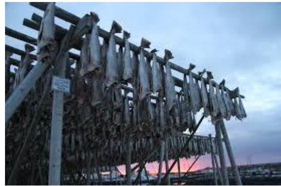
Skrei cod hanging to dry on a rack.

Nordland is a long and narrow county that borders Sweden. Bodø is the largest city in Nordland.