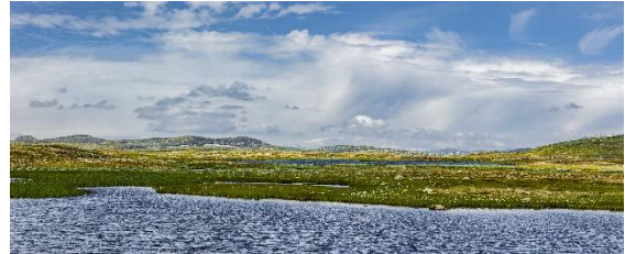
Hardangervidda mountain plateau

The Hardangervidda mountain plateau is the biggest plateau in Norway. It extends across Vestland, Viken and Vestfold og Telemark.